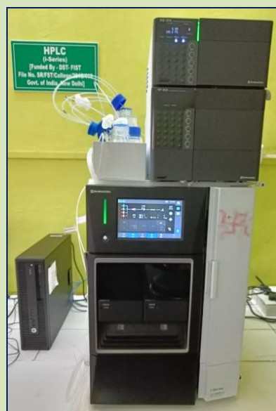
HPLC Shimadzu I series