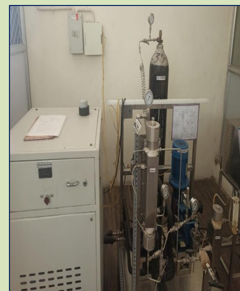
Super Critical Fluid Extraction